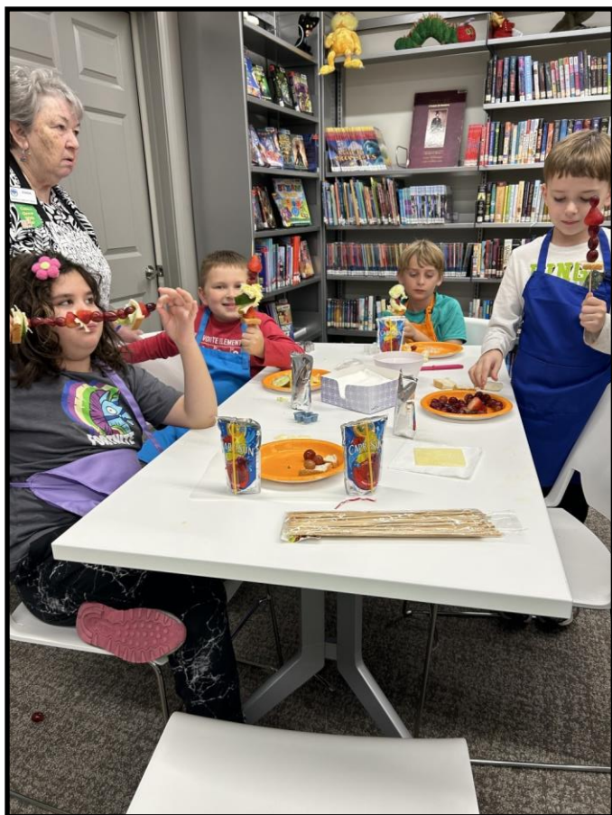
Our Junior Chefs, busy created their skewer sandwiches.