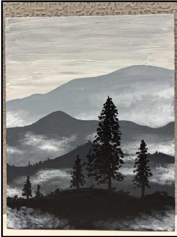
Couple of the paintings created at the October Craft Club.