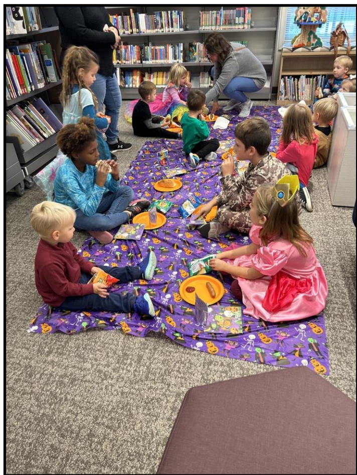
Kiddos had a blast at our Halloween Party! Hotdogs, games and candy oh my!